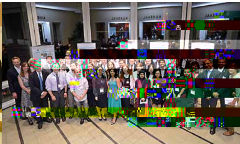
Bayer Lindau Fellows meet with Bayer scientists at the Lindau Nobel Laureate Meeting 2014 to exchange on “pioneering research for the benefit of society.”