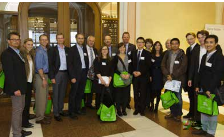
Bayer Humboldt Foundation Fellows at the “Science for a Better Life Symposium” in Leverkusen, 2013.

Each year, the Bayer Science & Education Foundation supports 20 young researchers from around the world to attend the conference as “Bayer Lindau Fellows.” Furthermore, the foundation organizes science dialogue evenings to exchange ideas and scientific spirit between fellows and senior industry scientists.